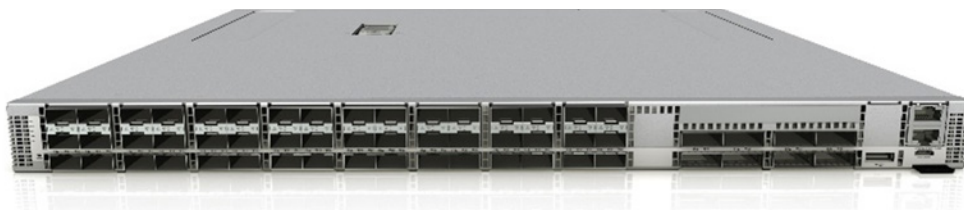
CSX8300 with 48 x 25/10GE + 8 x 100GE

CSX8300 offers 48x 25/10GE capable SFP28 interfaces and 8x QSFP28 (100GE) interfaces for uplink or aggregation connectivity. Each QSFP28 port can be configured as 4 x 25 GbE, 1 x 40 GbE, or 4 x 10 GbE by using DAC breakout cables. CSX8300 aggregate performance is 2 Tbps (4 Tbps full duplex).