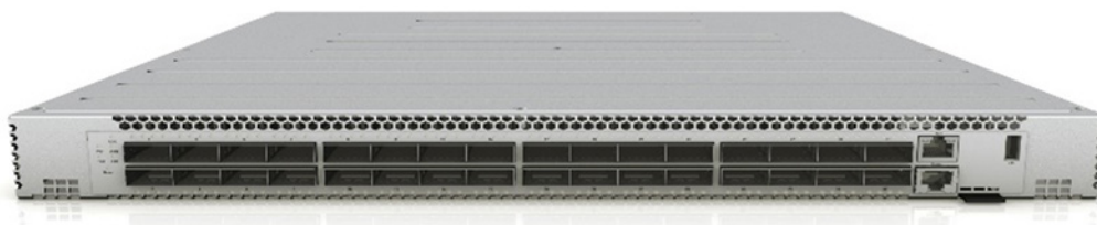
CSX8500 with 32 x 100GE

CSX8500 offers 32x QSFP28 (100GE) interfaces running at wire rate, offering aggregate performance of up to 3.2Tbps (6.4 Tbps full duplex). Each QSFP28 port of CSX8500 can be configured as 2x50G, 4x25G, 1x40GbE or 4x10GbE by using DAC breakout cables